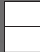
7-1/2 x 5 inches